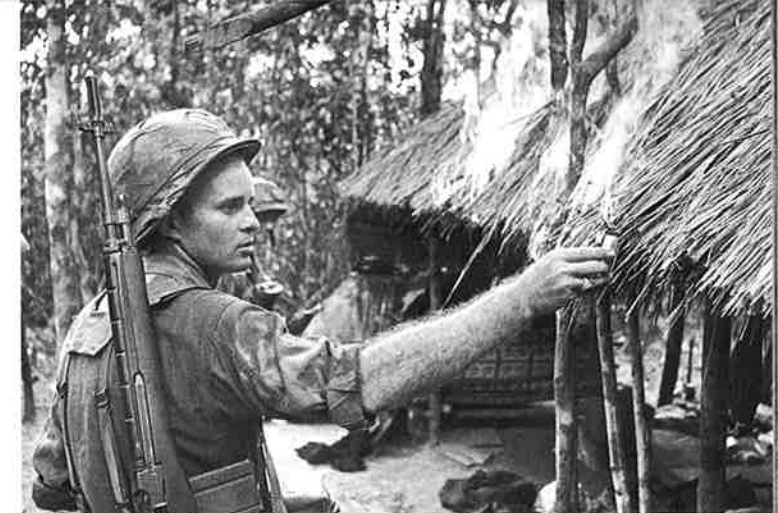
A US marine sets fire to a Vietnamese hut during a 'search and destroy' mission against the Vietcong

By 1968 there were more than half a million American soldiers in Vietnam. Despite this, on 30 January 1968 the Vietcong and North Vietnamese Army were able to launch the 'Tet Offensive'. They took control of dozens of towns and cities in South Vietnam. Although the Americans and South Vietnamese eventually drove them back, the US government now began to realise