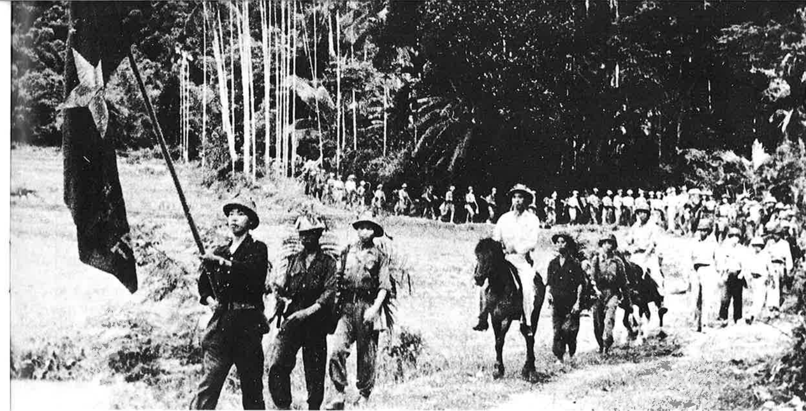
A Vietminh regiment marches through a jungle clearing in North Vietnam in 1952

Fearing that the domino effect would lead to all of Vietnam becoming communist, the US government gave aid to South Vietnam and started training a South Vietnamese army. When an anti-communist politician, Ngo Dinh Diem, became the first