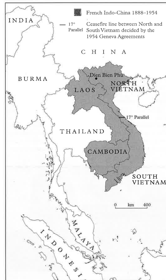
Vietnam and South-East Asia in 1954

During the Second World War, however, Indo-China had been occupied by the Japanese. When