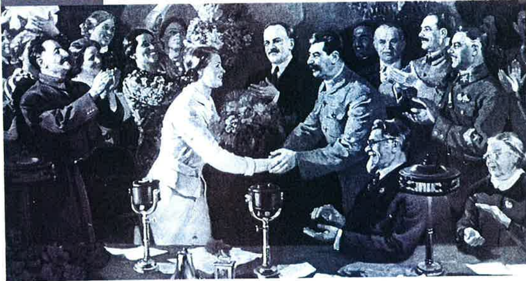
A painting entitled 'Unforgettable moment'.

A cartoon published by Russian exiles in France in 1939.